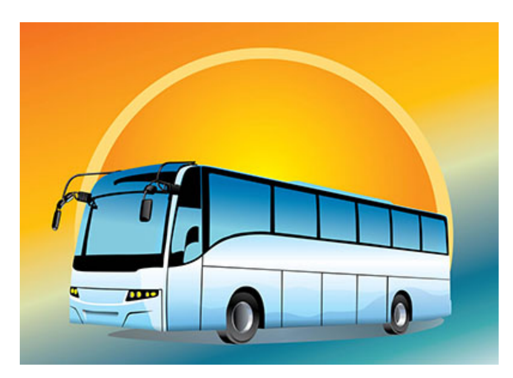
Attention All Veterans in Roswell Rotary Club!!!

Roswell Rotary is planning a bus tour of Memorials around North Fulton on Monday May 23rd. Please sign up so we have the proper head count for the bus and lunch! Please RSVP by Friday May 13th. <u>Click here to register.</u>