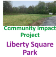
Community Impact Project Liberty Square Park