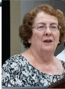
Last Week at Rotary