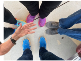
The Service Project Magician