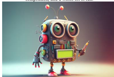
Thursday, March 6

They will bring their award winning bot and their epic STEM skills to Rotary. Watch their robot take on real competitive challenges and maybe get a chance to test your own skills. This presentation will highlight innovation, competition, and a whole lot of fun.