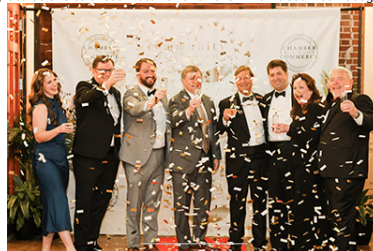
Thursday, March 6

Congratulations to these Rotarians for their well-deserved recognition!