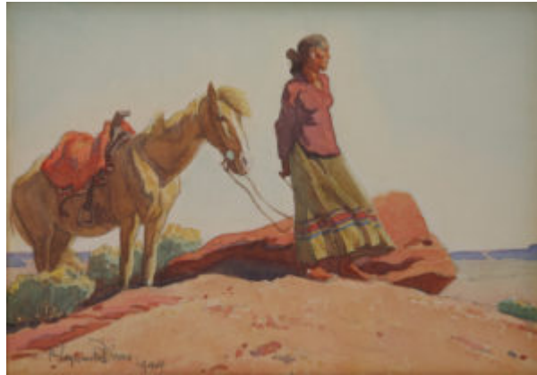
Image: © Maynard Dixon, Navajo Woman , 1944, watercolor, 7 x 10", Mark Sublette Medicine Man Gallery & Maynard Dixon Museum Tucson