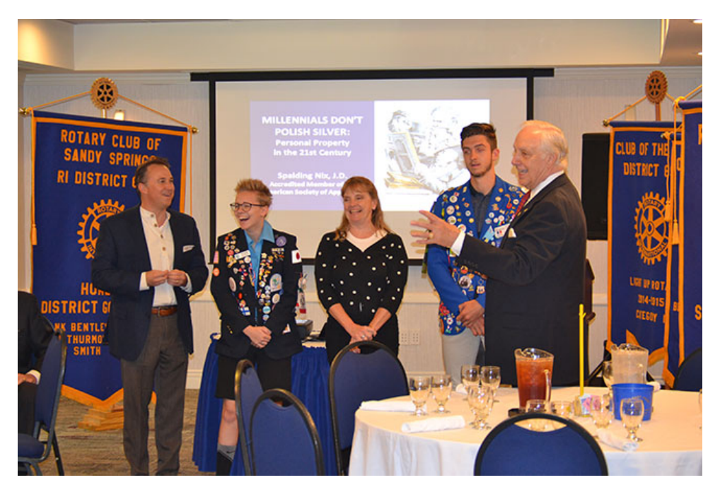
For more information on RYE, <u>click here</u>.