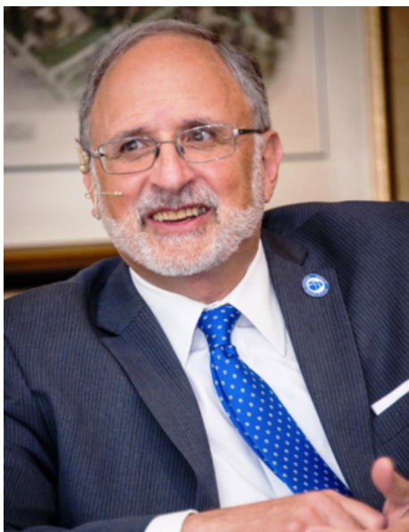
President, The World Affairs Council of Atlanta