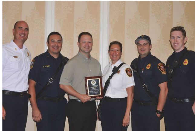
Marietta Fire Department Attendees