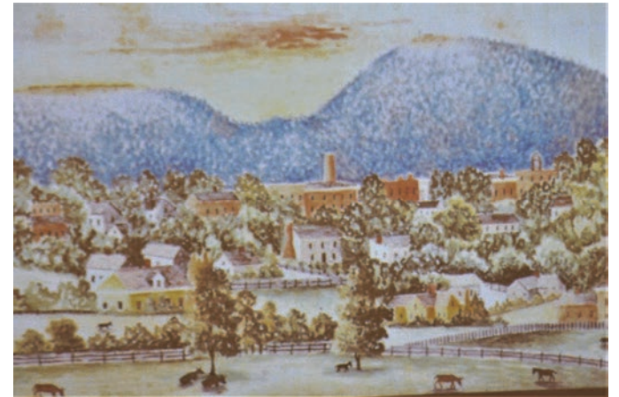
Pre-Civil War Marietta image from the Presentation