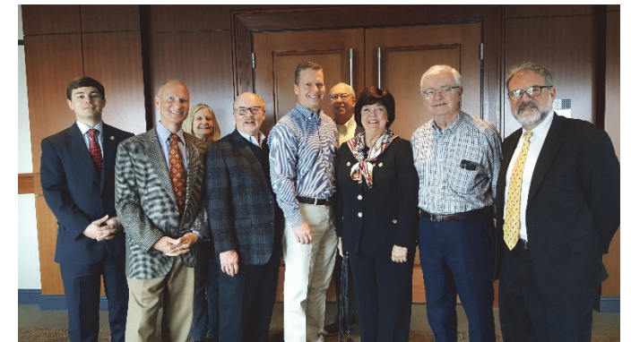
Club members met at superior court on January 18 th in support of Cobb Veteran's Court.